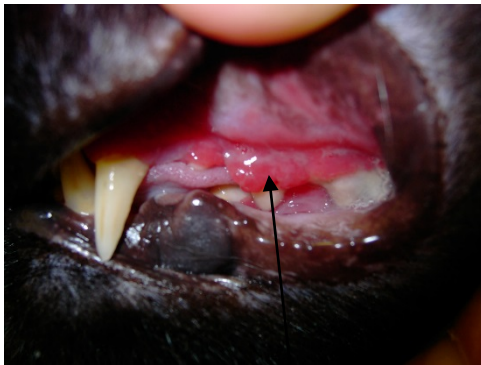
Inflammation of the upper gums

These diseases relate to the mouth, with stomatitis meaning inflammation of all the soft tissues of the mouth (in other words, everything other than the bones and teeth) and gingivitis meaning inflammation specifically of the gums. Some cats will suffer a generalised stomatitis where all tissues are involved, but other may show disease confined just to one area or to the gums alone.